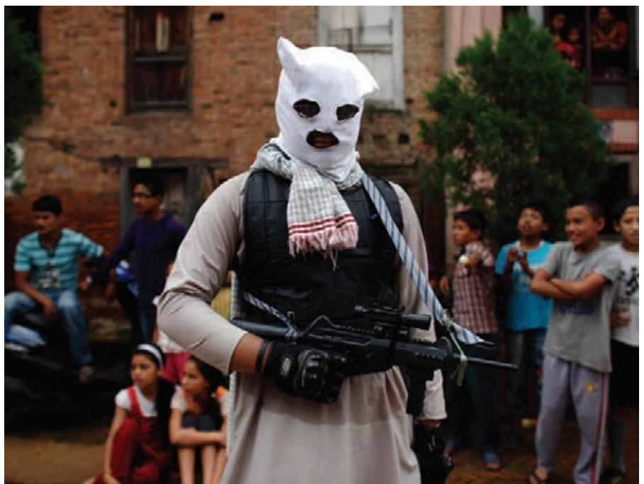
A masked devotee holds a toy gun as he takes part in a parade during a religious festival, indicating the salience of armed groups in Nepali society, in Lalitpur, August 2012.

This Issue Brief analyses the phenomenon of armed groups in Nepal. It examines their history, their initial proliferation following the signing of the